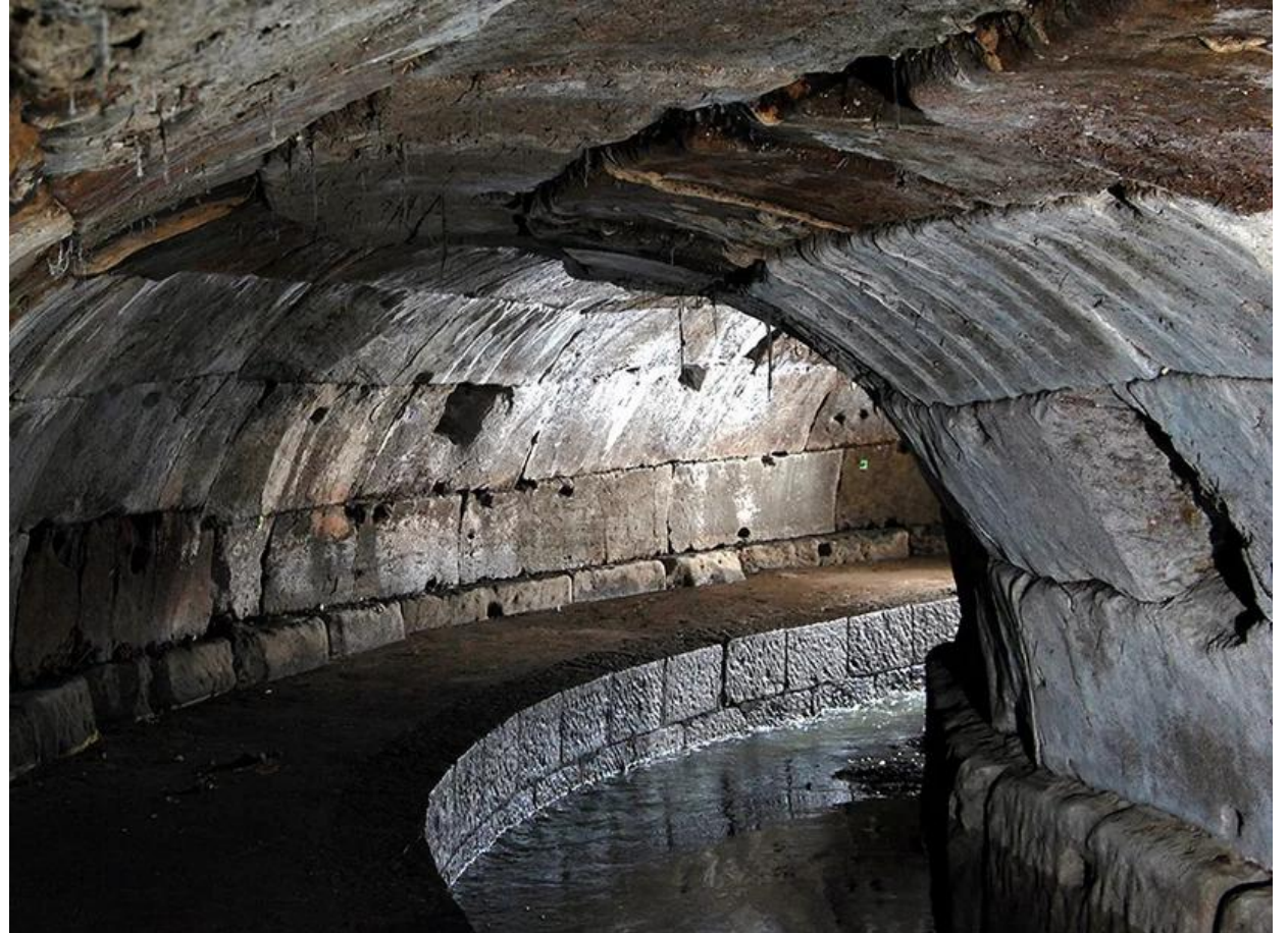
Cloaca Maxima, Rome (600 BC)