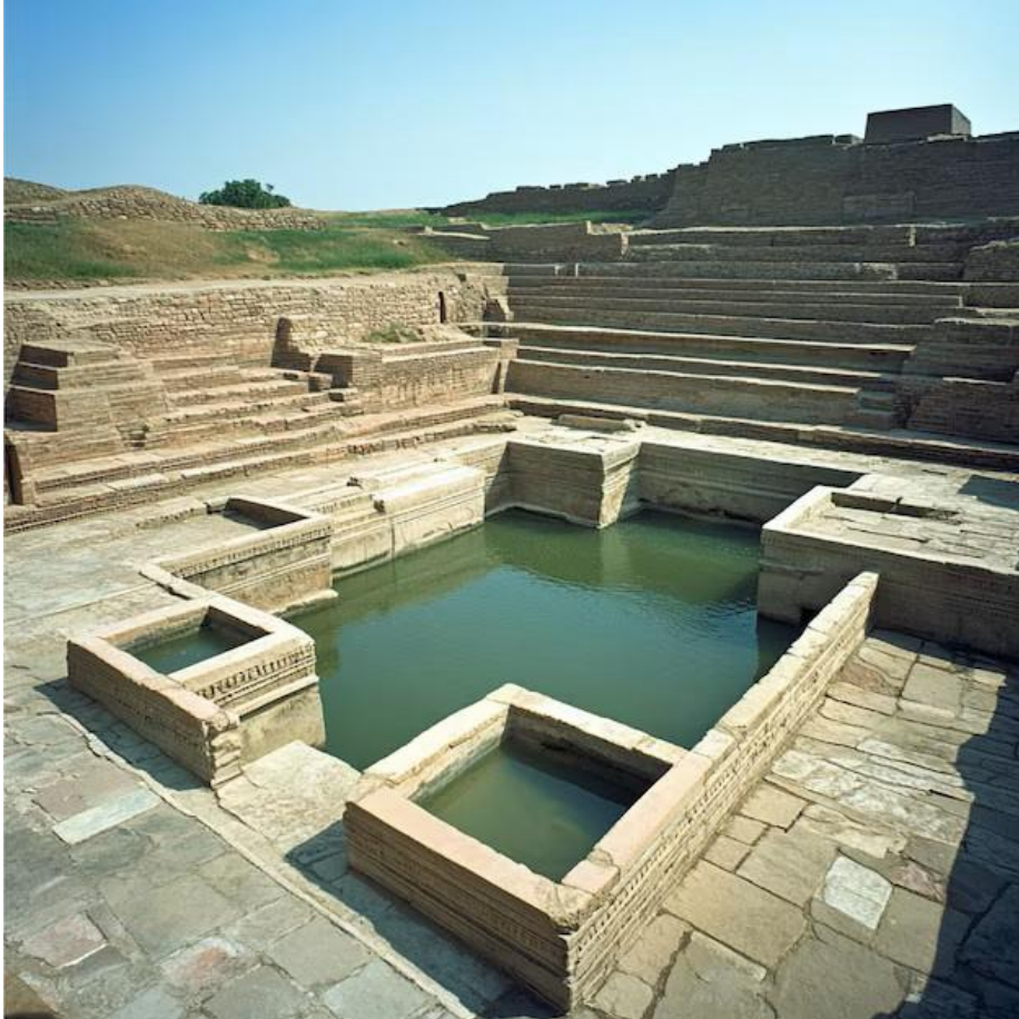
Great Bath, Mohenjo-daro (2500 BC)